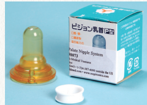
Pigeon Cleft Palate Nipple